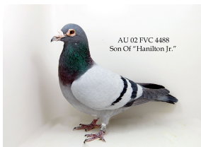
AU 02 FVC 4488 Son Of "Hamilton Jr."